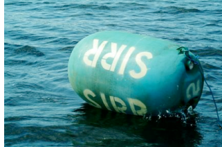
S.I. R.R. Marks are highly visible!

THE RACE WILL BE TWICE AROUND COURSE. IF WINDS ARE TOO LIGHT, THE RACE WILL BE SHORTENED TO ONE ROUND.